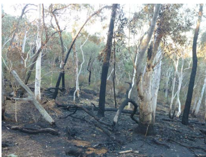
2017: Cool burn