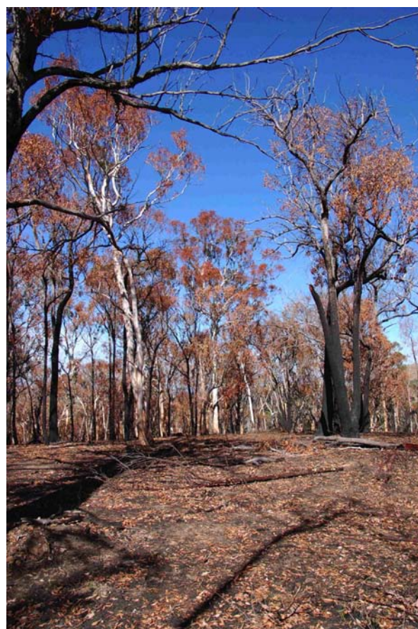
2016: Hot burn, 80% crown scorch