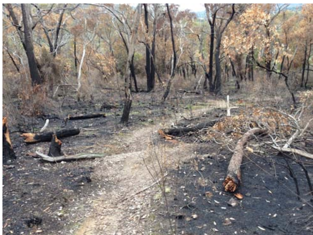
2014: Fire damaged educational walk