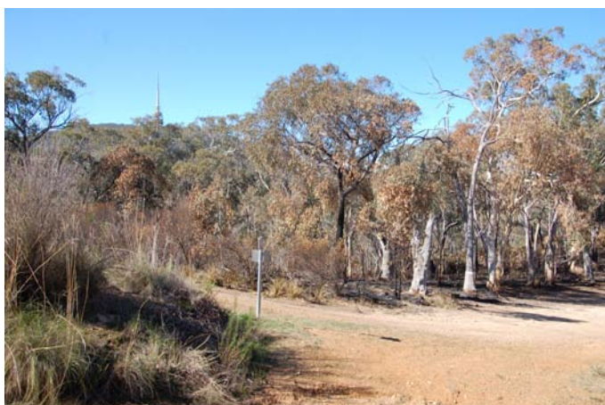
2017: Cool burn, some crown scorch