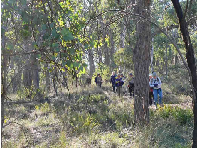
Eucalyptus macrorhyncha woodland

The walk began from Bindubi Street at the point where the grassland gives way to eucalypt woodland. There are a few Eucalyptus pauciflora in the grassland and then as the slope begins, E. bridgesiana , E. rubida , and E. blakelyi make an appearance, followed by E. melliodora , E. polyanthemos , E. rossii , E. mannifera and E. macrorhyncha . Among the flowers seen were Acacia genistifolia , Hardenbergia violacea and Melichrus urceolatus . A useful booklet Our Patch by Friends of the Aranda Bushland has colour photos of most of the plants found in the reserve.