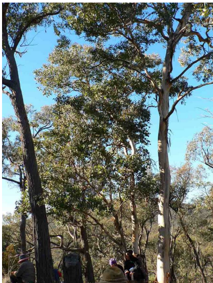
Lunch among E. polyanthemos