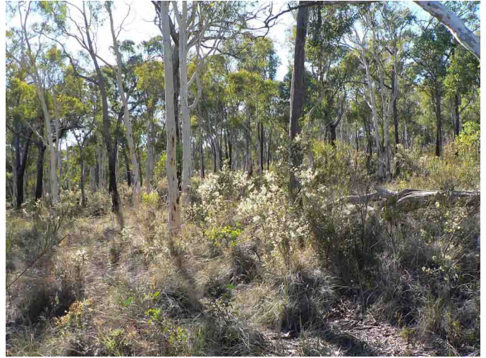
Acacia genistifolia in E. rossii / E. macrorhyncha woodland