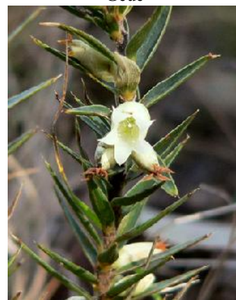
Melichrus urceolatus