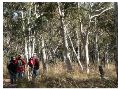
Eucalyptus rossii trunks