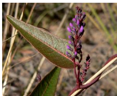
Hardenbergia violacea in bud