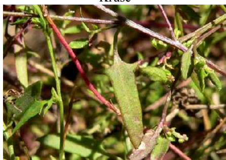
Einadia nutans leaves Image by Graeme Kruse