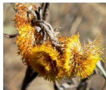
Chrysocephalum apiculatum