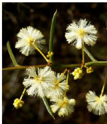
Acacia genistifolia