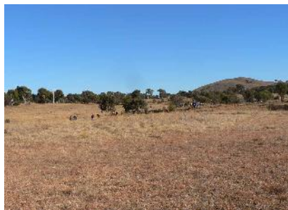
Frost Hollow

The walk starts from William Hovell Drive between Bindubi street and Caswell Drive, Aranda and crosses the low frost hollow before climbing into forest. The forest hollow is comprised mainly of grassland with scattered trees – Eucalyptus pauciflora , E. blakelyi and E. bridgesiana . There are some good examples of very old trees giving way to a wealth of young trees and saplings. As the terrain rose we noticed a change in the trees – E. rubida , E. melliodora and E. dives first making an appearance then E. macrorhyncha , E. mannifera , E. polyanthemos and finally E. rossii . There were not many flowers other than a few good Acacia genistifolia and A. dealbata plus some A. buxifolia in bud, some Cryptandra amara var. longiflora were in bud and some Hardenbergia violacea were showing purple but not yet out.