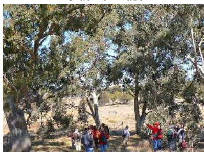
E. blakelyi (left) & E. rubida (centre & right)