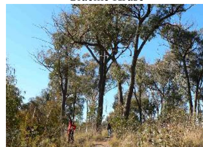
Dark trunks of E. macrorhyncha