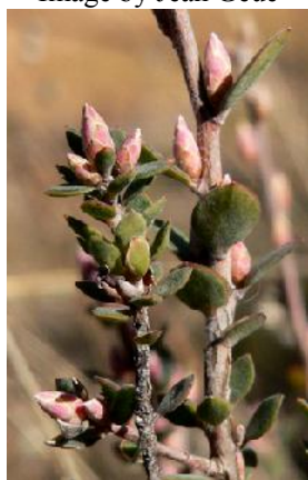
Brachyloma daphnoides buds Image by Graeme Kruse