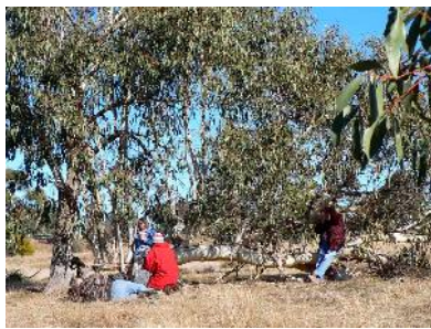
Snow Gums ( Eucalyptus pauciflora )